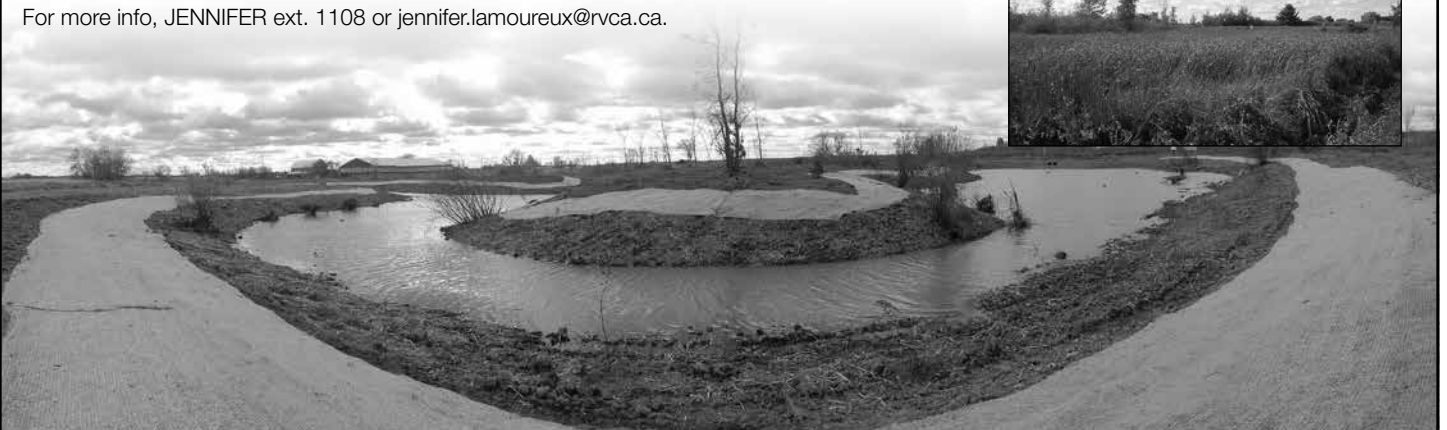
Top — dedicated volunteers help stabilize the new wetland shoreline. Middle — pre-construction. Bottom — panorama highlighting the stabilized shore and the new island.