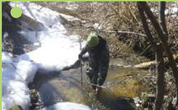
RVCA staff sampling a headwater drainage feature site on Ramsay Creek