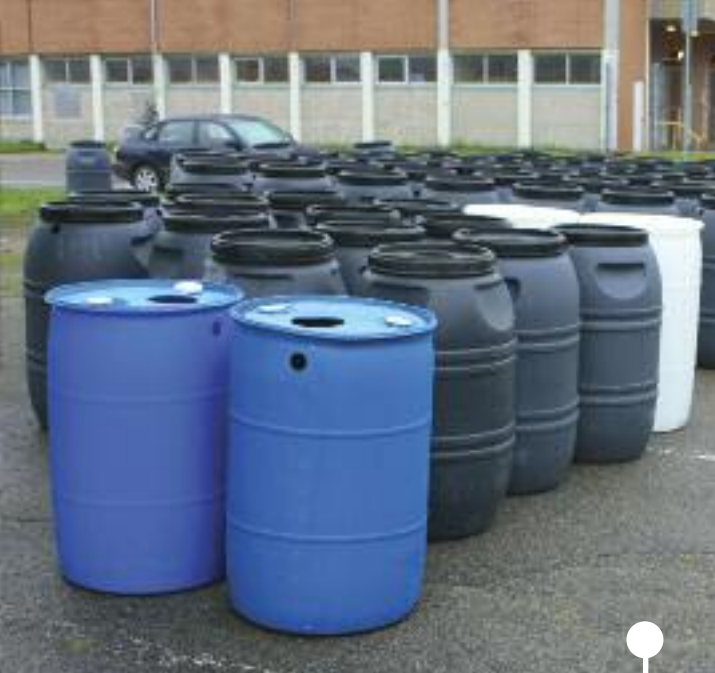
Rain Barrel sale Smiths Falls — May 11, 2013