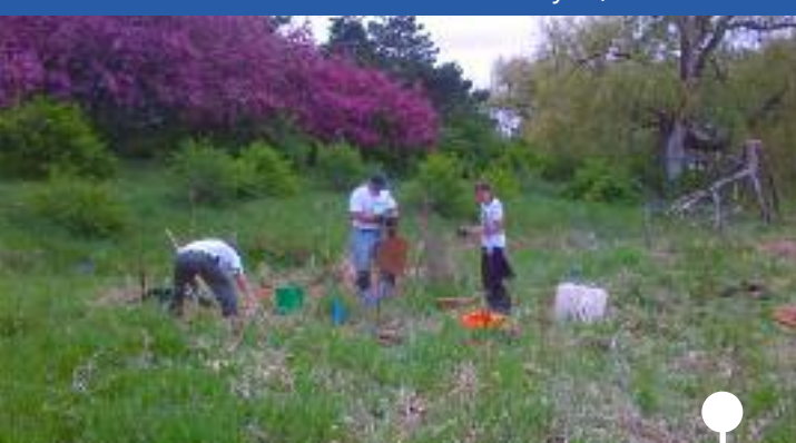
Naturalizing Stillwater Creek — May 10, 2013