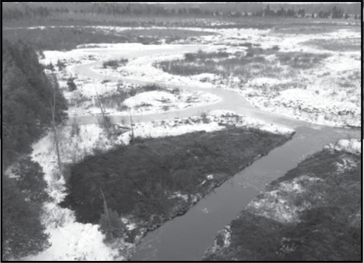
Channels being dug at the rehabilitated Hutton Marsh this winter.